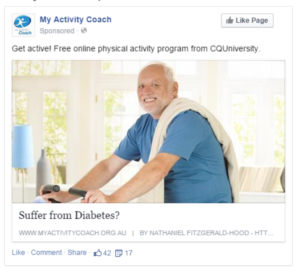
Figure 3. Feed advertisement targeted to males over 45 years with diabetes.